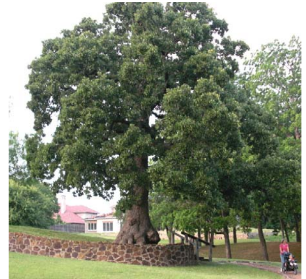
Post Oak tree Grapevine Springs Preserve